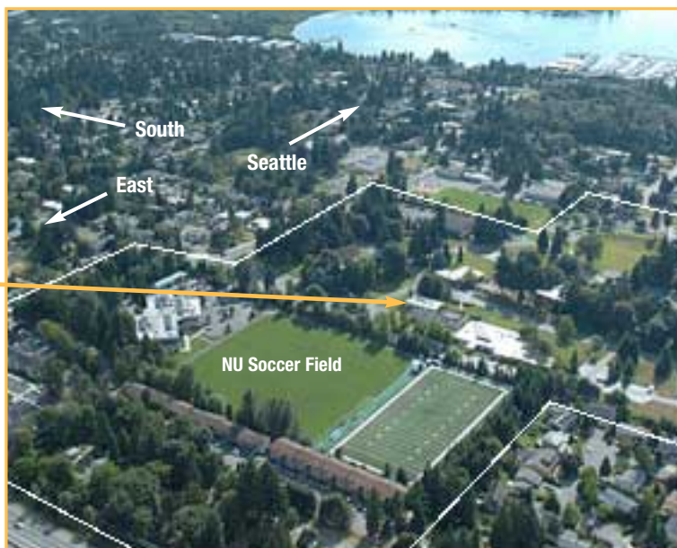
Northwest University campus (white outline) and the NU athletic/soccer fields.