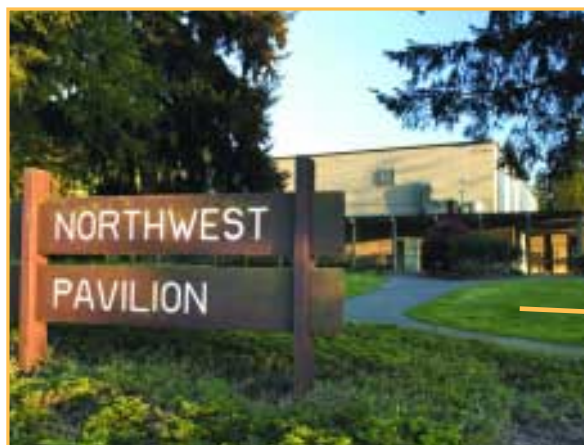
The Pavilion - Volleyball and basketball

The Northwest University athletic fields are at the top of our campus (east of the main campus) where the Seattle Seahawks former corporate headquarters and practice facility were located. Take NE 53rd (on the south border of the campus off 108th Avenue NE) and drive up the hill (east). Turn left at the third entrance to the campus and parking is available in the lot next to the Butterfield Chapel. The NU fields will be to your right as you turn into the campus. Visiting team buses and vans may park in the lot to the west of the fields near the Butterfield Chapel (see map on page 9).